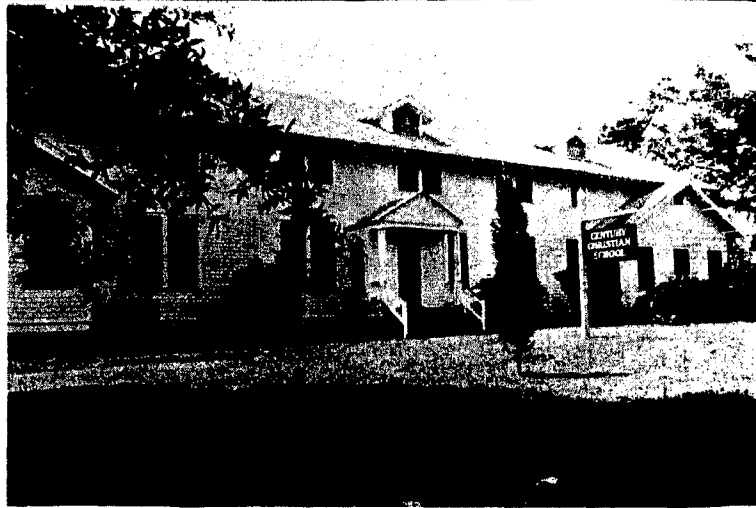
Former Alger-Sullivan Lumber Co. office will become Century Christian School.

(Enclose $25.00 plus $1.00 for mailing and handling).