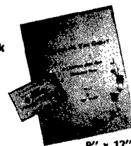
9" x 12"