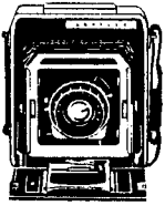
BY PETER J. FOX