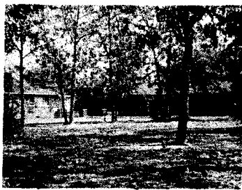
Home for GRADES K-5