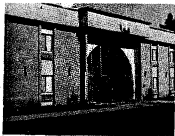
Dormitory for GRADES 6-12