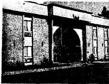
Dormitory for GRADES 6-12