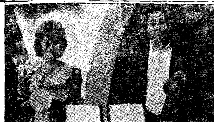
Science Fair Winners