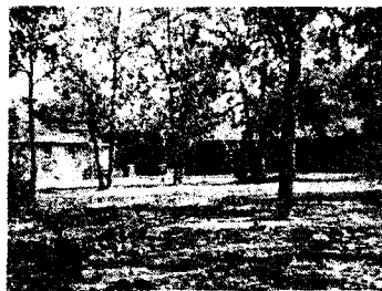
Home for GRADES K-5