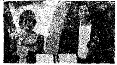
Science Fair Winners