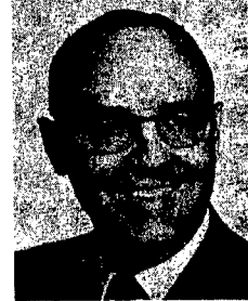
Why Was Governor Wallace Shot?