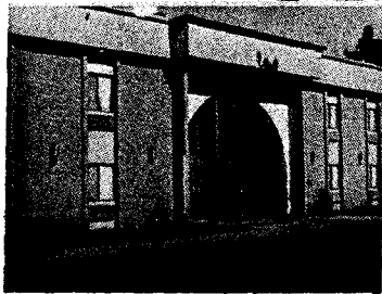
Dormitory for GRADES 6-12