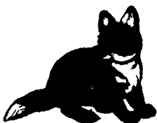
A True Fox Tale