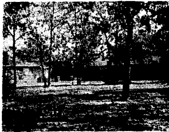
Home for GRADES K-5